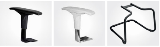
375 NR Black height adj. arm. Bracciolo reg. altezza nero. 375 BIA White height adj. arm. Bracciolo reg. altezza bianco. 880 NR Black stackable cantilever. Cantilever impilabile nero.